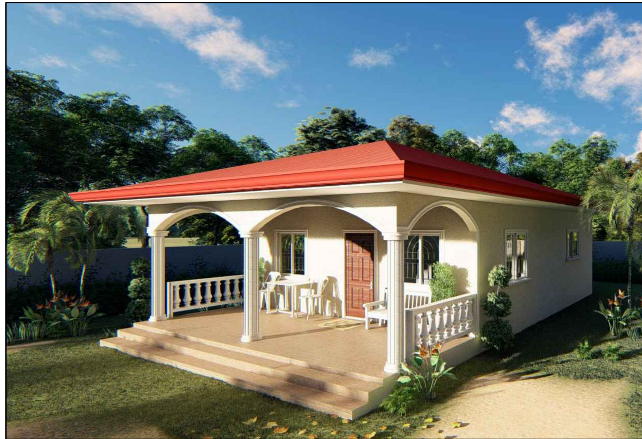
PERSPECTIVE NOT TO SCALE