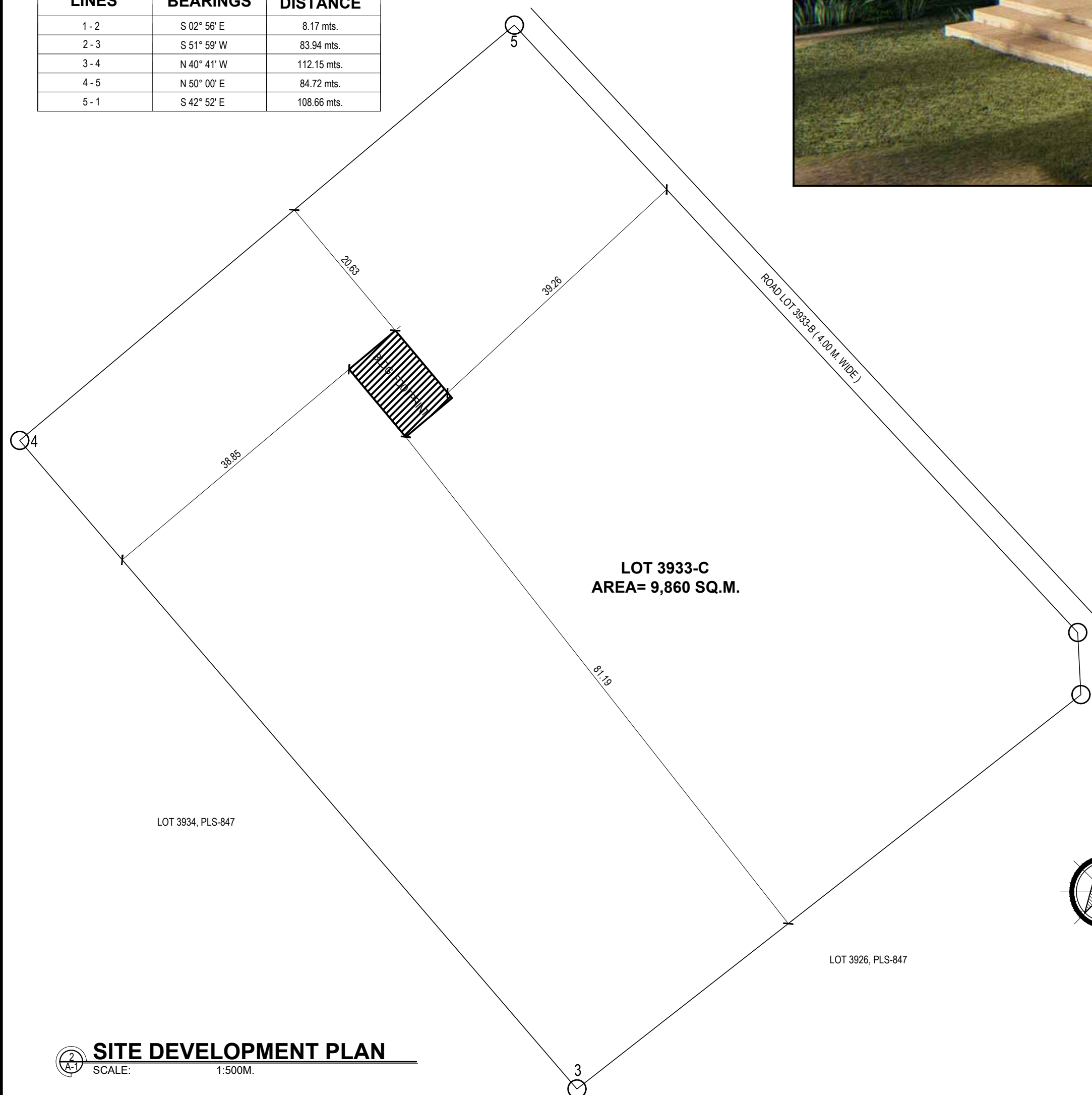
SITE DEVELOPMENT PLAN SCALE: 1:500M.